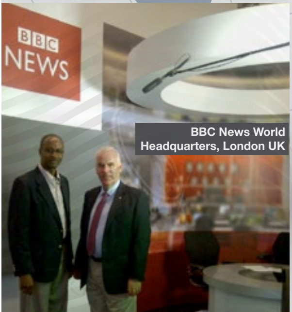
BBC News World Headquarters, London UK