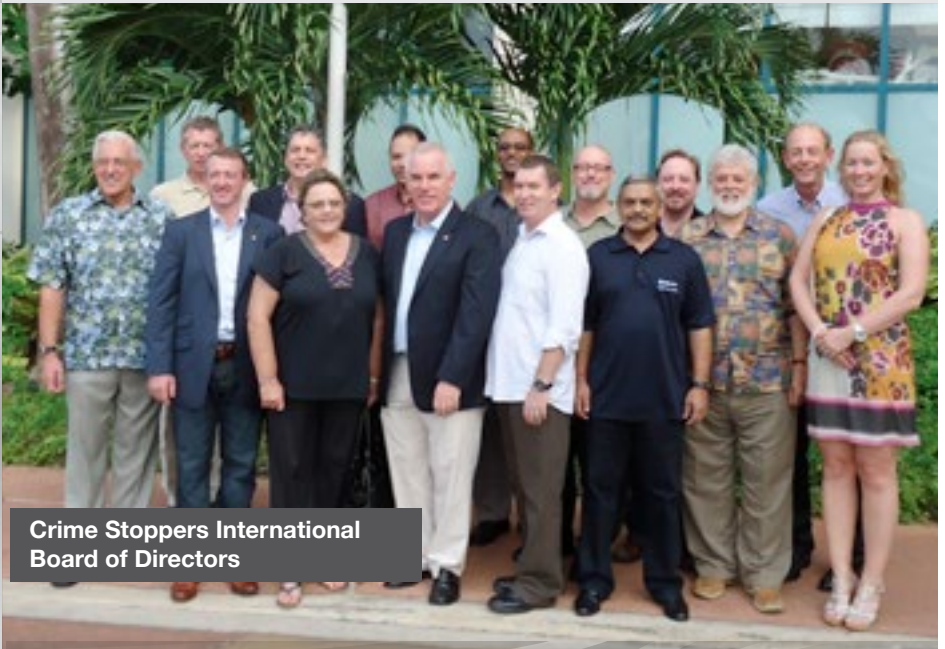
Crime Stoppers International Board of Directors