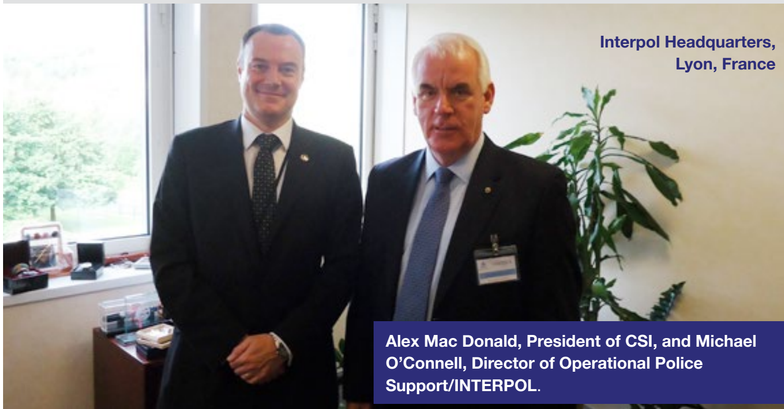
Interpol Headquarters, Lyon, France

Immediately following the Spring Board Meeting and Strategic Planning workshop, a meeting was held with the Director of Operational Police Support at INTERPOL, and several of INTERPOL's sub-directorates. We are pleased to advise that our Co-operation Agreement with INTERPOL is continuing, and discussions are currently underway as to the support that Crime Stoppers will provide in the execution of several global initiatives.