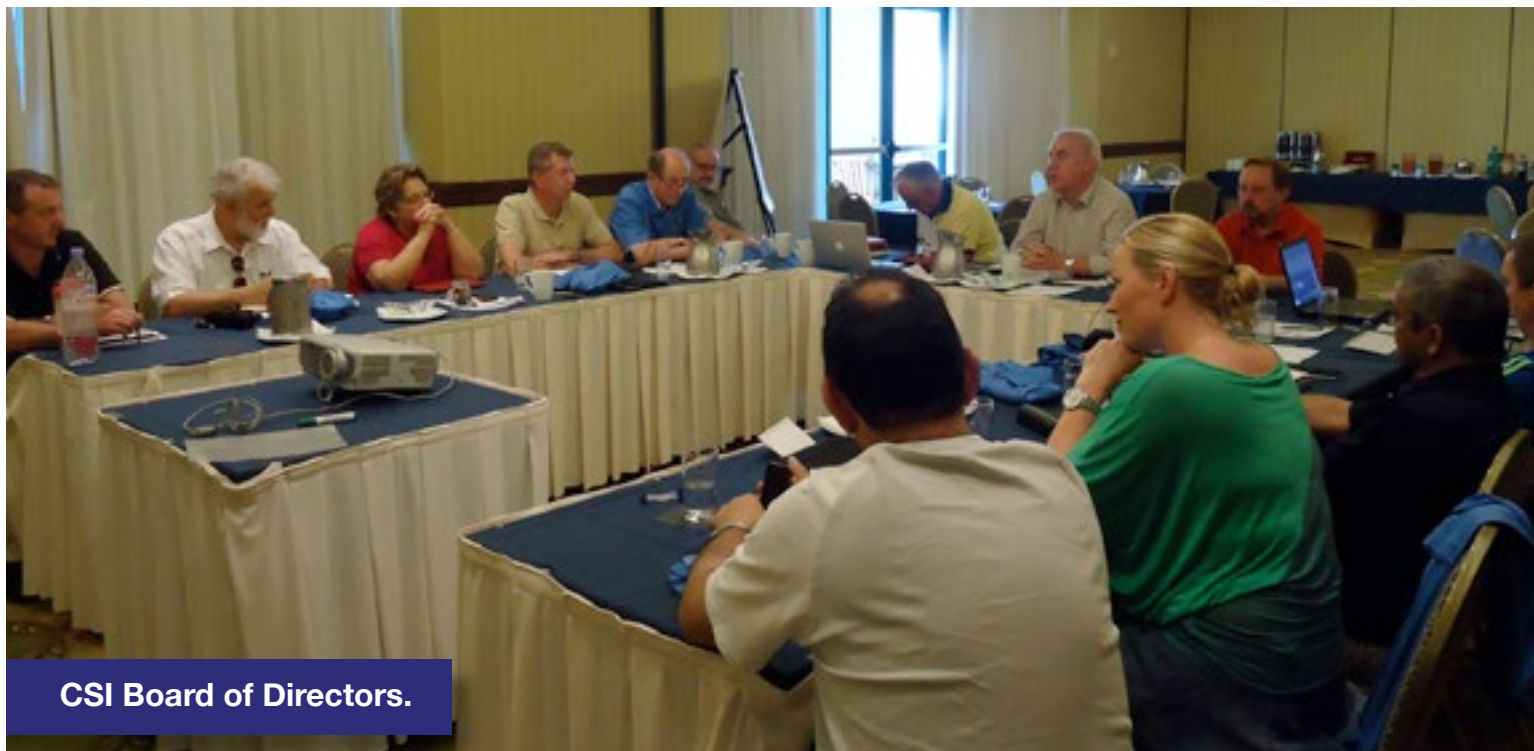
CSI Board of Directors.